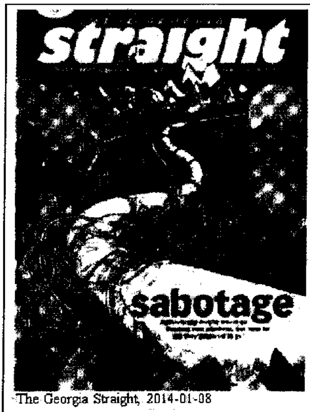
The Georgia Straight, 2014-01-08

Some pipeline opponents view the expansion of the Canadian pipeline network that will support the Oil Sands as a major contributor to global climate change. They argue the pipeline would increase carbon emissions by accelerating the pace of oil sands development, which releases more greenhouse gas emissions than the production and refining of more conventional types of crude. Others are focused on local concerns over the impact on land and water in the event of a spill.